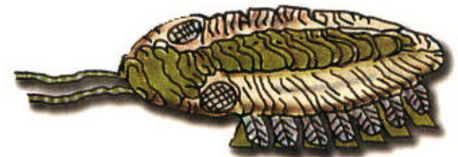
Completed model Trilobite